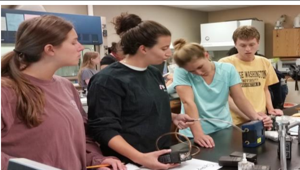
IH students are learning how to correct the volume of personal air sampler.

Considerable portion of our day is in the workplace. Ensuring that workplaces are safe and health is important to the well-being of everyone. Let us have fun to learn what exist in the workplace, what the OSHA regulation is and how to control these risk factors such as ergonomic stressors.