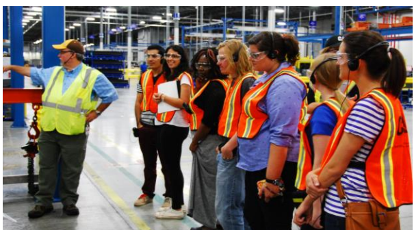
IH students are visiting Caterpillar Athens GA.